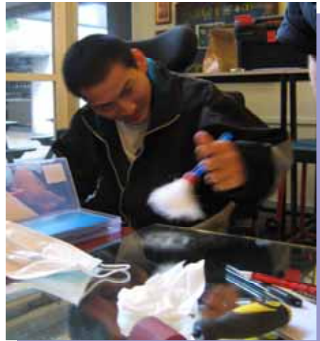
"Dusting for fingerprints"

Towards the end of the programme guest speakers and specialists' employment co-ordinators from Work and Income and Elevator provided valuable support.