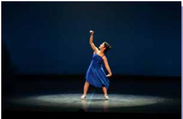
"Of course I can dance"

One of the schools she visits is the Carlson school, where she works with staff to introduce movements to the pupils there. A Scottish Reel was performed which led to great interaction. "Dance4everyone" takes the positive out of the situation. "It's not about people sitting in wheelchairs. It's about people